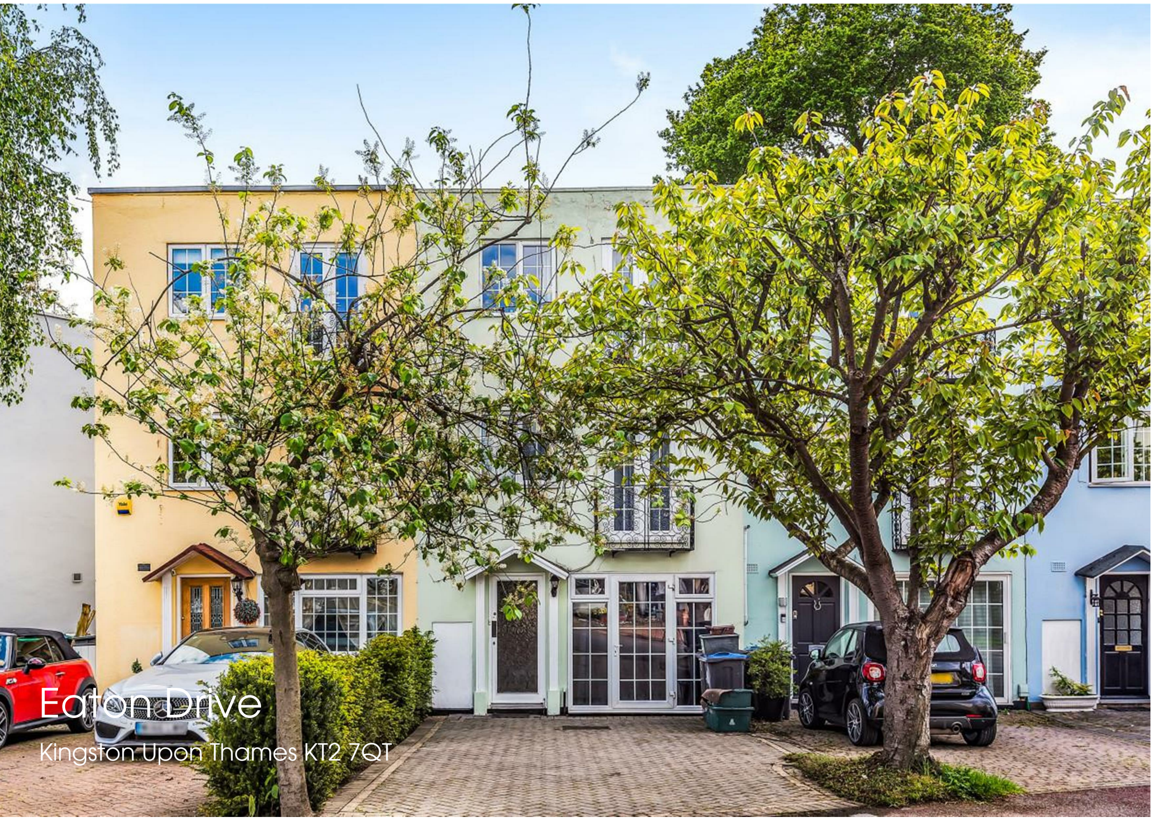
Eaton Drive Kingston Upon Thames KT2 7QT

34 Richmond Road Kingston upon Thames Surrey KT2 5ED www.gibsonlane.co.uk Tel: 020 8546 5444